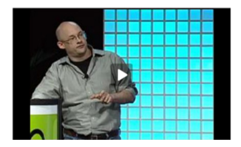
Video 1. Clay Shirky introduces the concept of the Cognitive Surplus at the 2008 Web 2.0 Expo.

Educators are exploring how to take advantage of the cognitive surplus in connection with in-school activities. For example, Richard Sterling, chair of the National Commission on Writing advisory panel, comments on the increasing prevalence of blogs maintained by teens outside school (<u>Audio 1</u> includes the fuller context of Sterling's statement):