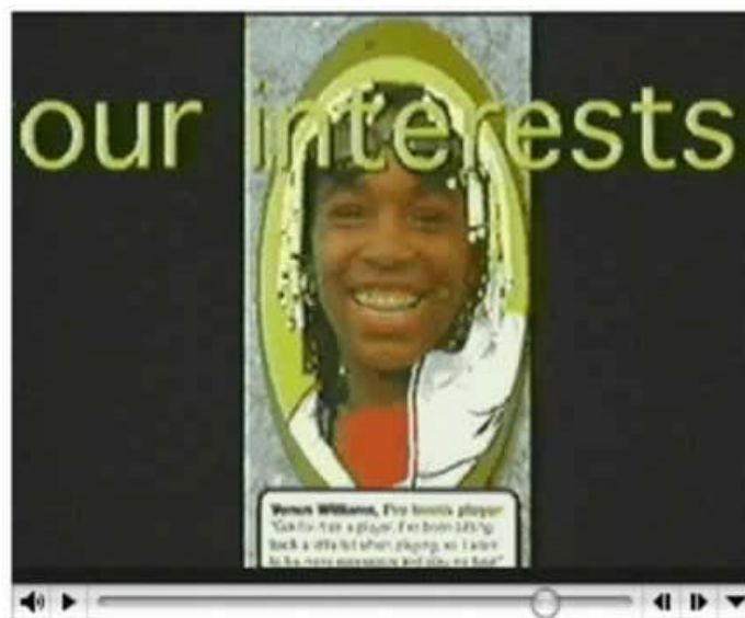
Figure 4. Knowledge as Power – Period 7