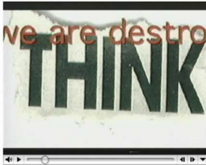
Figure 3. Knowledge as Power – Period 7

of a cartoon featuring Garfield the cat sitting in front of a computer first in deep thought, then with a light bulb glowing in his thought balloon. A music transition to "you're world champion now" accompanies a series of new images "ASK," "THINK," "LEARN," and a scrolling quote from the novel about knowledge being lost for good if they die (Figure 3).