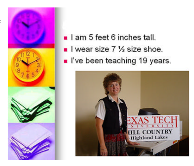
Figure 1. Powerpoint slide from the Meet Me Mathematically assignment.

Students also explore the idea of introducing themselves via PowerPoint using mathematical terms and numbers in an activity called Meet Me Mathematically (see Figure 1; for the full slideshow, see http://www2.tltc.ttu. edu/cooper/ Meet%20Me%20Mat hematically.ppt). For example, students think of significant dates, number of family members. shoe size, height. distances traveled. and more. Using PowerPoint, they create slides that