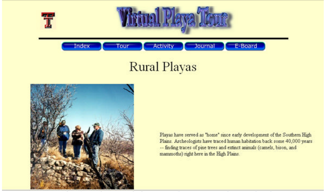
Figure 3. Screenshot from the Virtual Playa Tour (http://www7.tltc.ttu.edu/jthomas/)