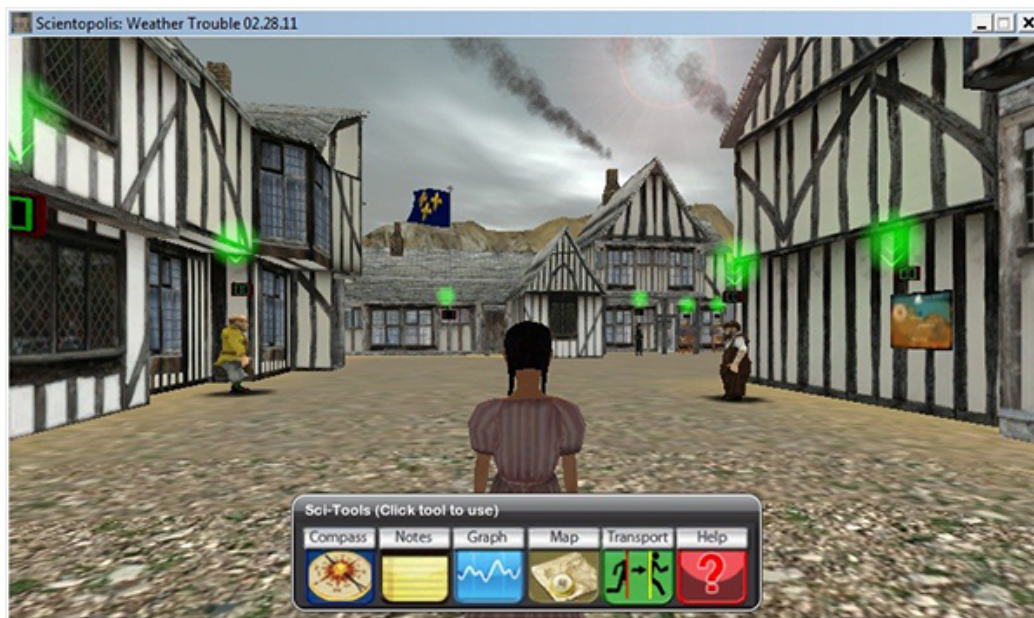
Figure 3. Weather data source examples.