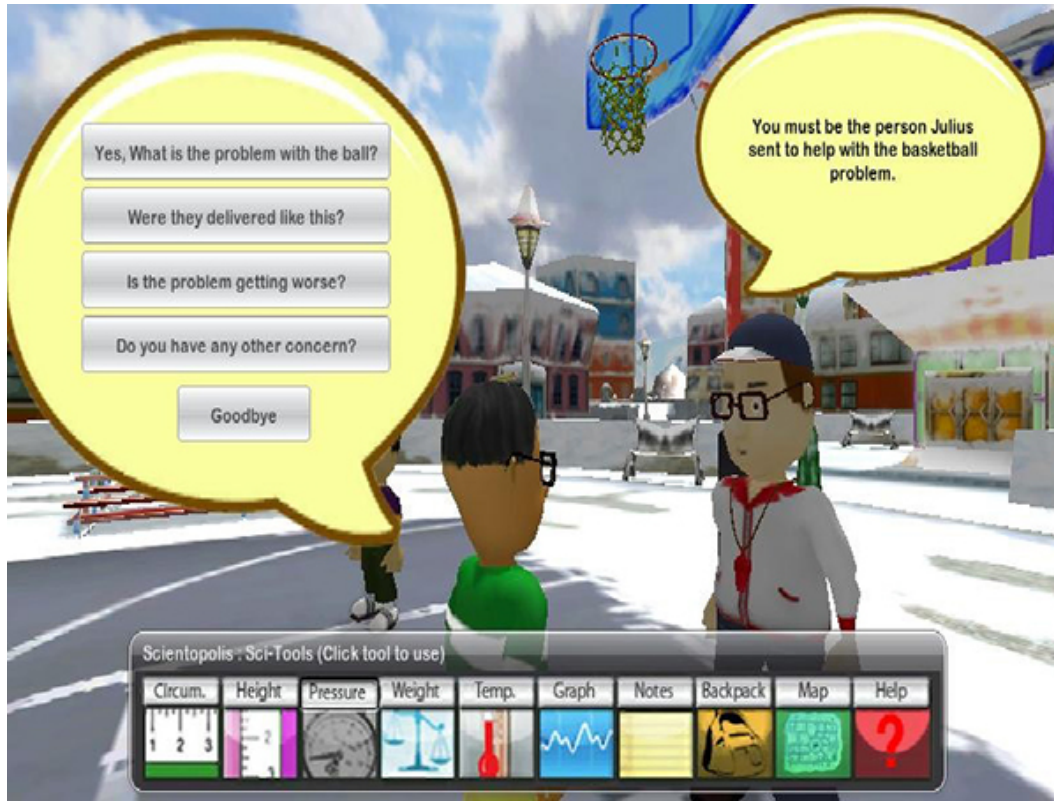
Figure 2. Basketball Trouble.