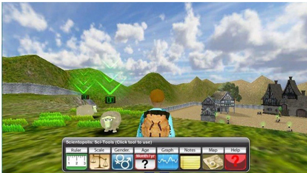
Figure 1. Sheep Trouble.

Students can explore and gather data in their efforts to solve the posed problem, and when they are done they respond to a nonplayer character's questions about the problem, supporting their inferences with the data they collected and ranking that data in importance for solving the problem. All actions and interactions by the students within the world are recorded and used to map the students' inquiry behaviors as well as used to score their performance. Finally, for validation purposes, students are asked to answer a few multiple-choice questions drawn from various high-stakes district-, state-, or national-level tests that are related to the same topic but modified for the context of the module.