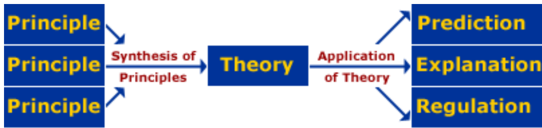
Figure 1. A theory is synthesized from principles of phenomena and seeks to inform the prediction, explanation, and regulation of those phenomena.

and describe the particular effects of these factors [on thought and behavior]" (Ormrod, 1999, p. 4). These principles are then meaningfully combined or synthesized to form a theory. The theory, however, is useless unless it can be applied through prediction, explanation, or regulation.